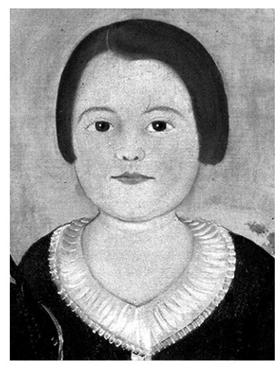
Figure 12. Charles William Poor's head.

which we find the other creative geniuses of mid-19th-century America.