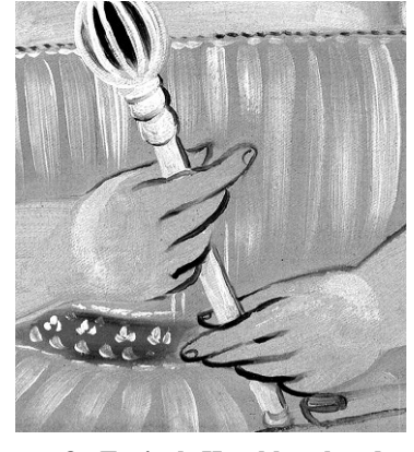
Figure 8. Typical Hamblen hand with tapered alignment of fingers.

When attempting attributions, care must be taken. Similarities among paintings indicate that the artists borrowed from each other. For example, the chin of the Hamblen baby in figure 7 is like a Prior chin. Hands by Hartwell and Hamblen are at times quite similar. Thus there are no absolutes. Details must be examined, and the more details that can be seen and evaluated on each portrait, the more certain the viewer can be of his/her attribution.