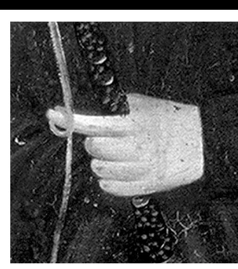
Figure 13. Charles William Poor's pointed forefinger with the whip cleverly wrapped