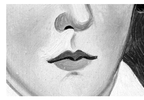
Figure 19. Typical Hartwell lips from another attributed painting.