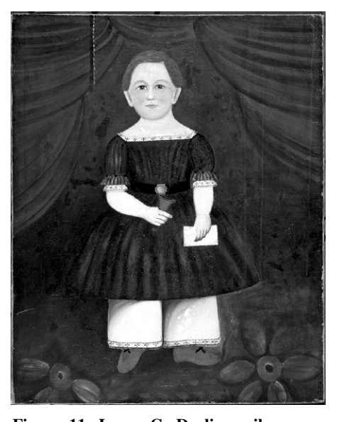
Figure 11. Leroy G. Darling, oil canvas, 40" x 28¾", painted on back "Leroy G. Darling, Died Oct. 29, 1845, Painted by E.W. Blake." Collection of Shelburne Museum, Shelburne, Vermont.

William Mathew Prior was a creative artistic genius who found ways to supply what many people wanted quickly and affordably. He deserves to be placed on the same type of pedestal as those on