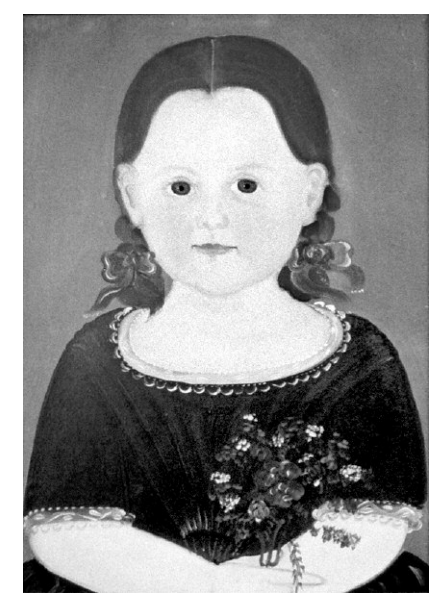
Figure 9. Daughter of Hopkins Choice, oil on board, 14" x 10 1/8", attributed to the "Pointed Finger Artist." See forefinger pointing to right at bottom. Privately owned.

The four artists probably occasionally worked together, saw each other's work, and discussed how to depict various features. That all were creative is shown by the way they simplified their depiction of features and artifacts to create impressions, possibly to save painting time.