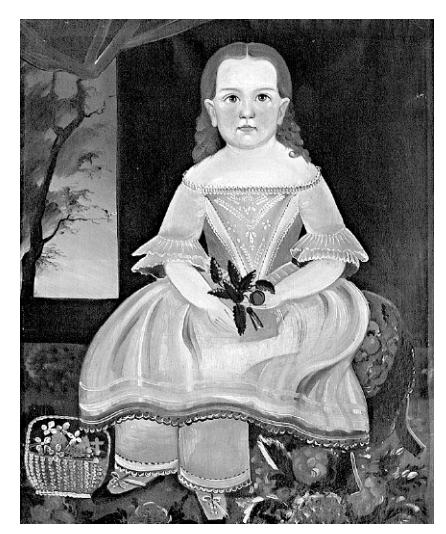
Figure 6. Portrait of a child, oil on canvas, 27½" x 22½", signed on left shoe "S.J. Hamblen," auctioned twice by Sotheby's. Owner unknown. Photo courtesy

portrait to a member of the group. The best option, placing the painting in question next to one for whom the artist is known and then comparing, is usually difficult because of disparities of ownership and geographic locations. But because artist of the group did sign some paintings that still exist, by looking for specific features in those paintings and then checking other paintings attributed to the same artist to see if those features are common throughout the artist's work, it is possible to pinpoint some specific details that can suggest which artist did which painting. Many of these details are known to professionals in the field of folk art. Showing some of them in black and white when they might be better depicted in color may be difficult, but we will try.