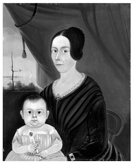
Figure 7. Portrait of a mother and child, oil on canvas, 27 1/8" x 22 1/8", signed on back (now covered by relining) "Hamblin/ East Boston/ 1848." Collection of Museum of Fine Arts, Boston; gift of Edgar William and Bernice Chrysler Garbisch, 1981.

centerline. The top lip, usually very thin, has two pyramidal bumps separated by a deep central cleft. Note the pointed finger at the bottom of the painting.